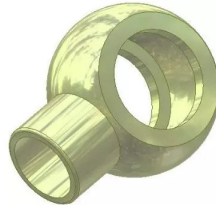
British Banjo To Tube Braze Fitting